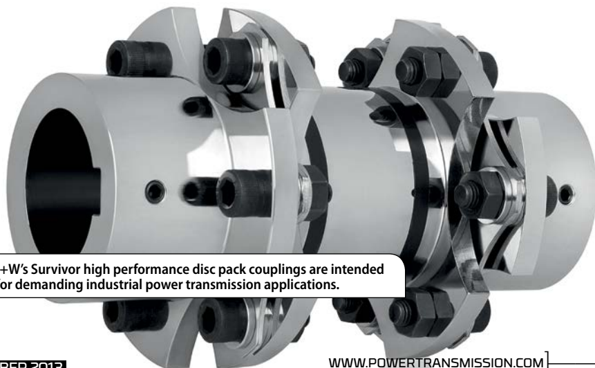
R+W's Survivor high performance disc pack couplings are intended for demanding industrial power transmission applications.

"The coupling industry has seen a significant amount of consolidation in the last five years, and we would expect to see continued movement in that direction. Additionally, we would expect to see continued global expansion of those established companies into the non-traditional manufacturing countries," O'Neil says.