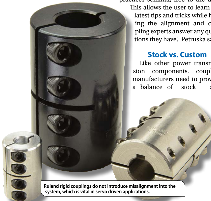
Ruland rigid couplings do not introduce misalignment into the system, which is vital in servo driven applications.

“Altra Couplings provides a full range of couplings solutions from off-the-shelf products to very highly-engineered products. A significant part of our business involves taking standard, off-the-shelf products and modify-