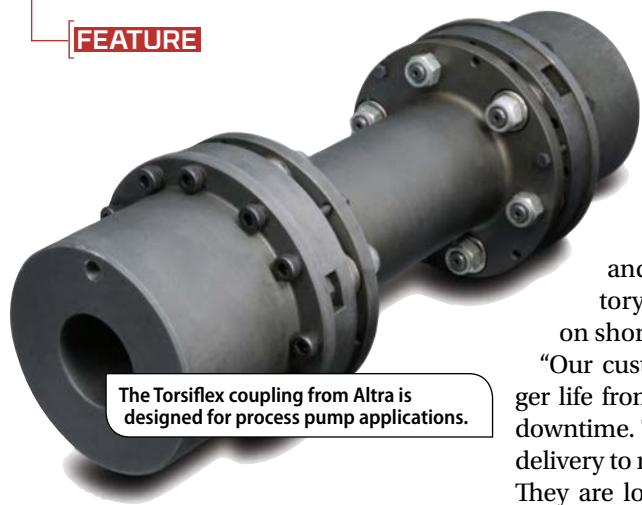
The Torsiflex coupling from Altra is designed for process pump applications.

ing them to meet specific customer requirements. One of the advantages of our wide range of product offering is that a customer can build an entire plant with couplings from one company. Whether it's a critical process compressor running at 15,000 rpm or a fractional horsepower pump, all needs can be met with one supplier with established pricing," says O'Neil.