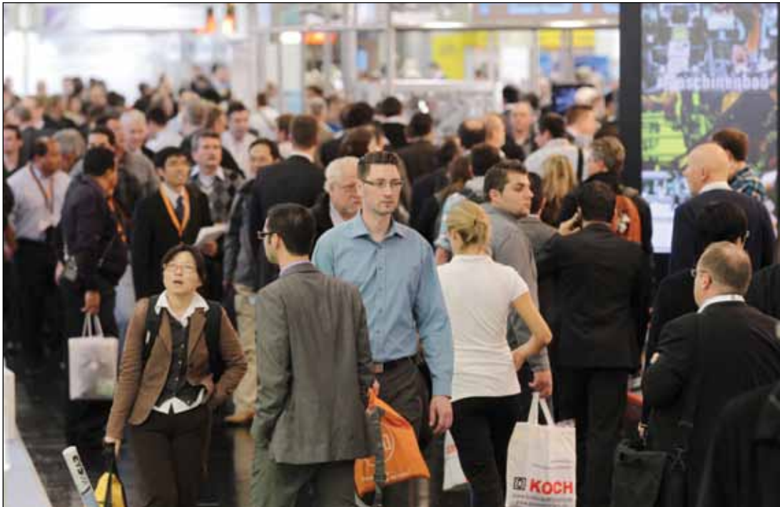
The automation industry was in full force at SPS-IPC Drives 2011 with increased attendees and exhibitors.

SPS-IPC Drives 2011, which took place in Nuremberg, Germany in November, covered all components down to complete systems and integrated solutions in the electric automation industry. The trade fair and its adjoining conference provided information on products, innovations and current trends with products and services presented in control technology, IPCs, drive systems and components, human-machine-interface devices, industrial communication, sensor technology, industrial software, interface technology, electromechanical components and peripheral equipment. Trend topics for the exhibition included energy efficiency, safety and security, and industrial identification.