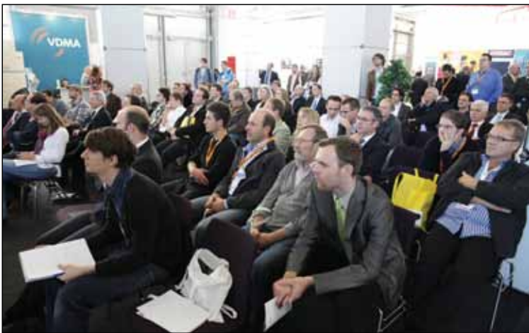
The conference sessions at SPS-IPC Drives provided a platform for discussions between product developers and users.

during the exhibition. The multichannel remote I/O modules can be combined with single-channel modules for high-integrity applications and single-channel loop integrity where needed. Communication gateways can be upgraded to communicate with the new remote I/O modules, and the existing LB backplanes support the new modules. Each module has one diagnostic LED per channel, so on-site diagnostics can be easily identified.