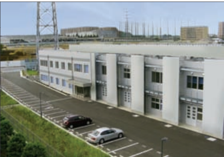
Aerotech's new Tokyo facility.