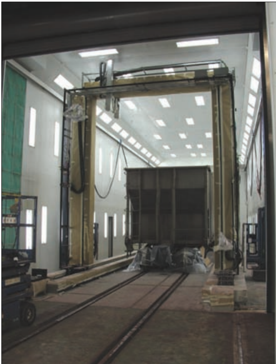
This automatic boxcar painter uses bearings from Lee Linear.

ings and asking how we can help them drive out costs. We've been doing that for years and have a good relationship with them. Probably the only way U.S. manufacturing is going to be here 30 years from now is to work directly with the customers both early and often."