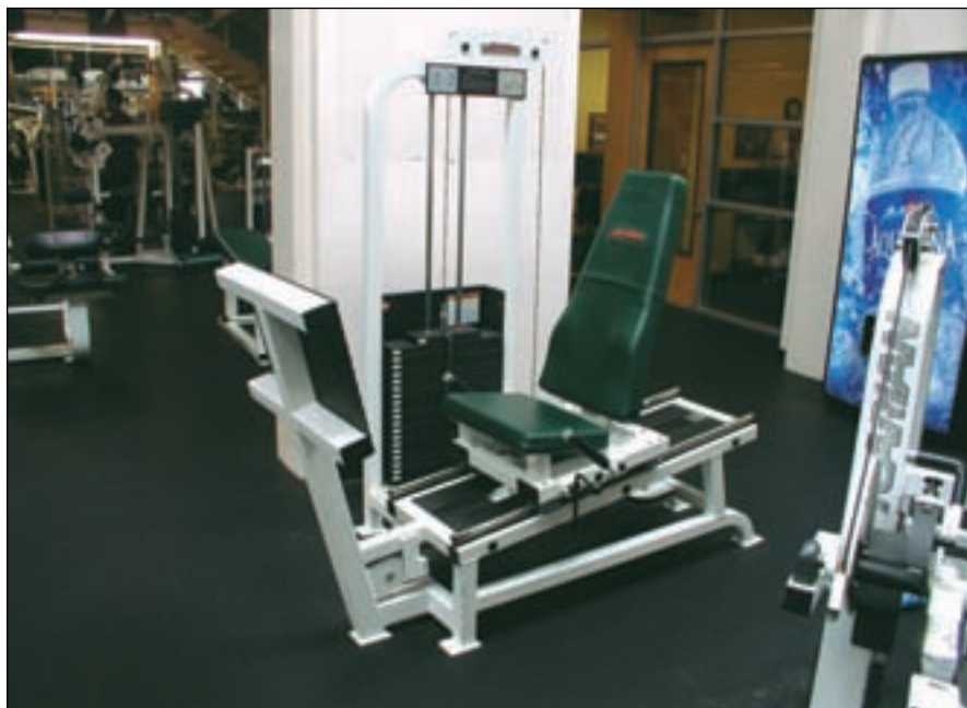
This exercise equipment for rehabilitation uses bearings and shafts from Lee Linear.