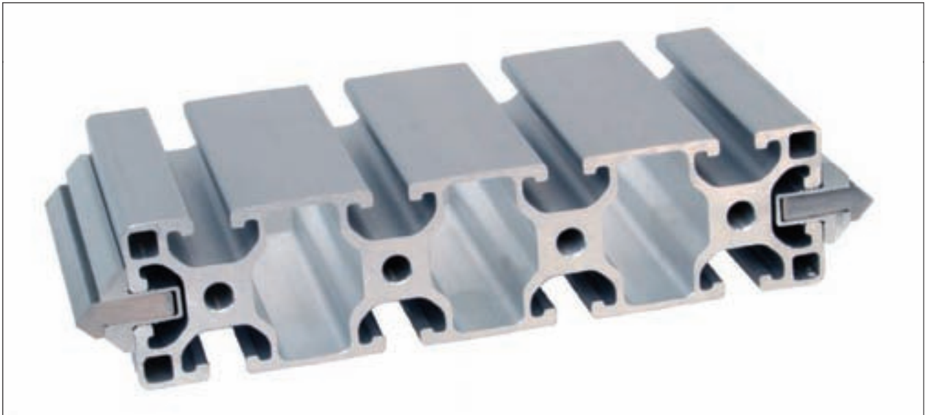
The QT Clamp Extrusion from Bishop-Wisecarver is currently being installed in its first application.

neering manager at Bishop-Wisecarver. “It has a self-cleaning mode of operation and we’ve always been recognized for our overall quality in this department.”