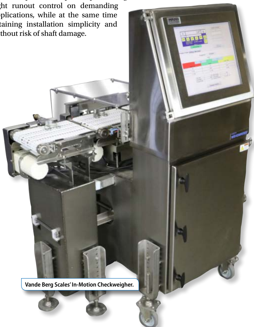
Vande Berg Scales' In-Motion Checkweigher.

For more information: Custom Machine and Tool Co., Inc. Phone: (800) 355-5949 www.cmtco.com Vande Berg Scales Phone: (712) 722-1181 www.vbssys.com