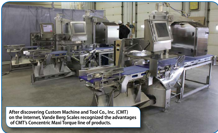
After discovering Custom Machine and Tool Co., Inc. (CMT) on the Internet, Vande Berg Scales recognized the advantages of CMT's Concentric Maxi Torque line of products.

With its ease of positioning and the fact that it virtually defeats shaft damage due to its mechanical shrink fit, this