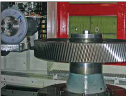
Gear grinding using special fixturing to support weight and torque.

Nothing unusual, really. Workholding techniques are an important part in the manufacturing process