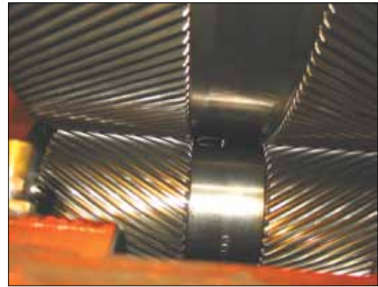
Helical gear grinding of large wind turbine gearbox components often requires off-center crowning to center load the gear in operation.