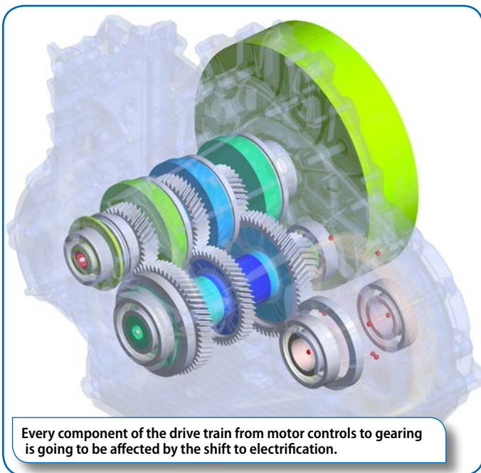
Every component of the drive train from motor controls to gearing is going to be affected by the shift to electrification.

But for every expert you find that's warning of a potential