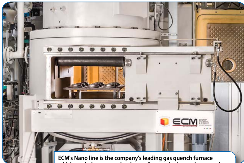
ECM's Nano line is the company's leading gas quench furnace which can help you acquire the quality required to make gears that will succeed in an electrified automobile.

“It's rare for an OEM to develop a brand new vehicle with