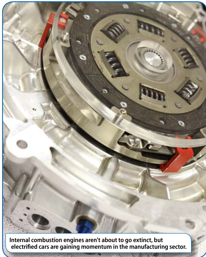
Internal combustion engines aren't about to go extinct, but electrified cars are gaining momentum in the manufacturing sector.

This holds true across all segments related to automotive