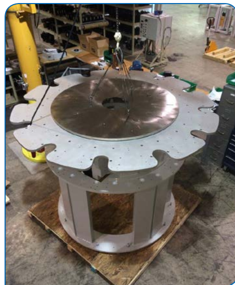
To accommodate the downward forces generated by the assembly machine’s press stations, the Weiss design uses an intermediate riser weldment going through the indexer and bolting to the middle riser frame.

The combination of robust construction and innovative, ‘open-center’ design allowed the Weiss engineering group to provide Alpha with a superior, one-source automotive parts assembly