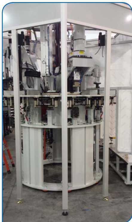
This automated assembly machine produced by Alpha Integration, required an innovative design and custom approach from supplier Weiss North America.

In the process of laying out the plan of the machine, Alpha’s senior mechanical design engineer, Sam Westbrooks, knew he wanted an open-center indexer to mount the tooling towards the inside of the dial system on a stationary center plate. This design configuration would accommodate ease-of-loading for its 12 load stations, as well as pro-