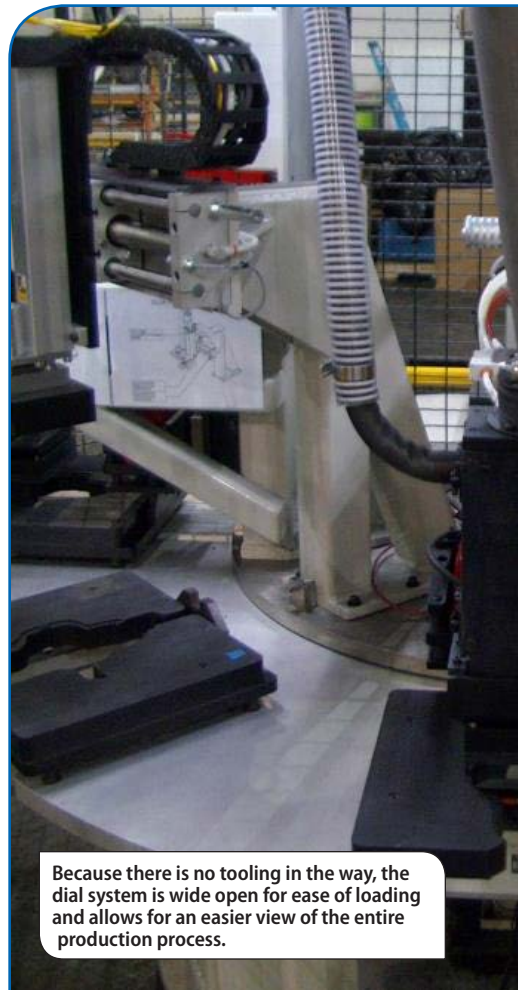
Because there is no tooling in the way, the dial system is wide open for ease of loading and allows for an easier view of the entire production process.

The majority of the machine’s 12 stations required a press station to be bolted on top of the 1" thick steel stationary plate. These press assembly stations apply down forces onto the nests that are carried by the index table’s aluminum tool plate. To overcome potentially debilitating force of approximately 900 lbs. acting on the 410 lb. center stationary plate and index table, Weiss’ design leveraged an intermediate riser weldment going through the indexer and bolting to the middle riser frame which by-passed the indexer totally—creating a ‘no-forces’ solution onto the index table that promotes longevity.