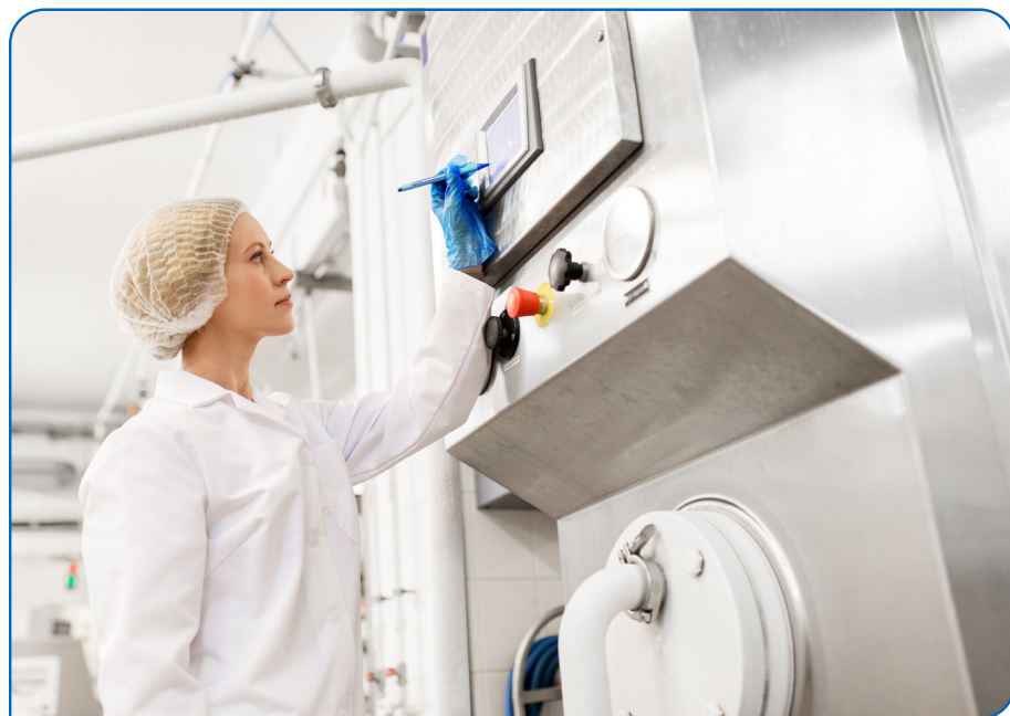
Manufacturing is moving from reactive to a more controlled system maintenance approach.

Manufacturing jobs are becoming more complex, including the maintenance of the hi-tech plant equipment. However, the answer to the labor shortage and transfer of knowledge may be rooted in additional technology.