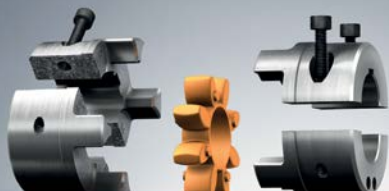
ROTEX® with Split Hubs