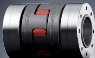
ROTEX® GS Zero Backlash