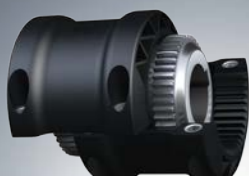
BoWex® with GT Sleeve