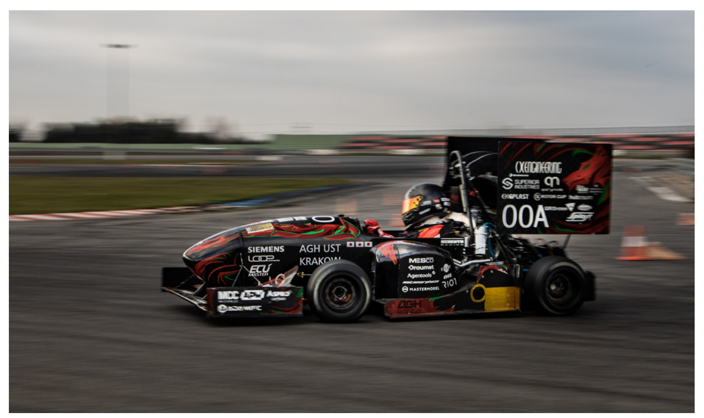
Powered by a combustion engine.