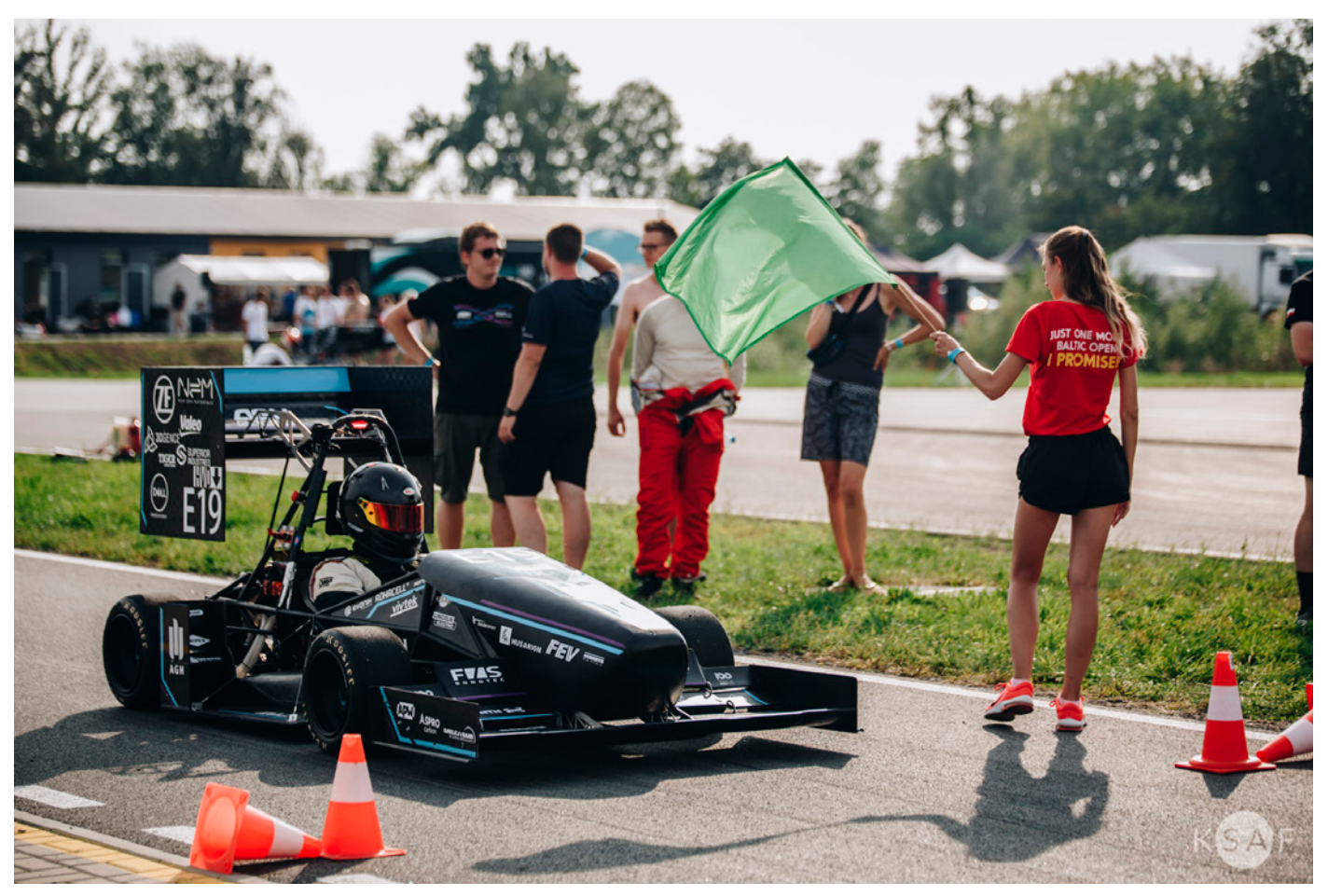
Powered by an electric motor.