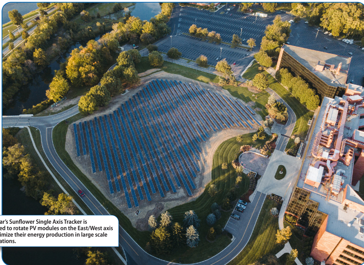
RBI Solar's Sunflower Single Axis Tracker is designed to rotate PV modules on the East/West axis to maximize their energy production in large scale installations.

To accommodate this stress, competitor systems need to