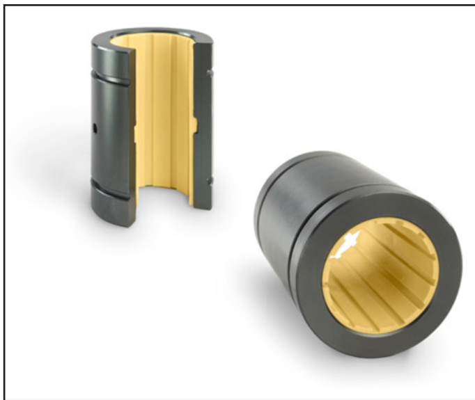
Figure 1 With no balls or rolling elements as part of their construction, plain bearings such as the recently launched Thomson polymer bushings provide a smooth, quiet and economical option for light-load linear motion applications.

The precision steel design (Fig. 2a) uses hardened-steel linear ball bearings that have point-to-point contact on a fixed surface ground into it, whereas 2b and 2c utilize floating bearing plates.