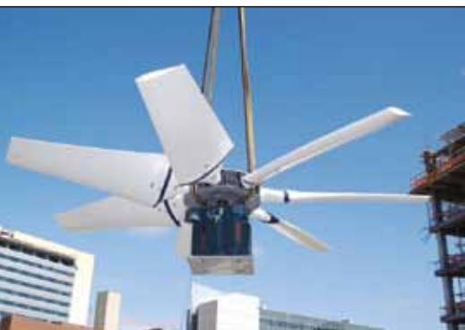
A traditional cooling tower fan drive features a right-angle gearbox mounted under the fan powered by a drive shaft attached to an induction motor.

The motors also run quieter, and the reduction in noise level is important, especially in towers that are located near “people-dense” buildings. In addition, by replacing the gearbox, the potential for