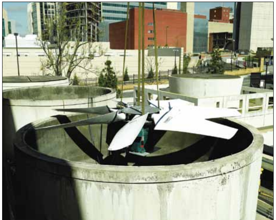
The Baldor Reliance RPM AC Cooling Tower Direct Drive Motor is designed exclusively for the cooling tower industry. This motor combines the technologies of the power-dense, laminated frame RPM AC motor with high performance, permanent magnet salient pole rotor designs.