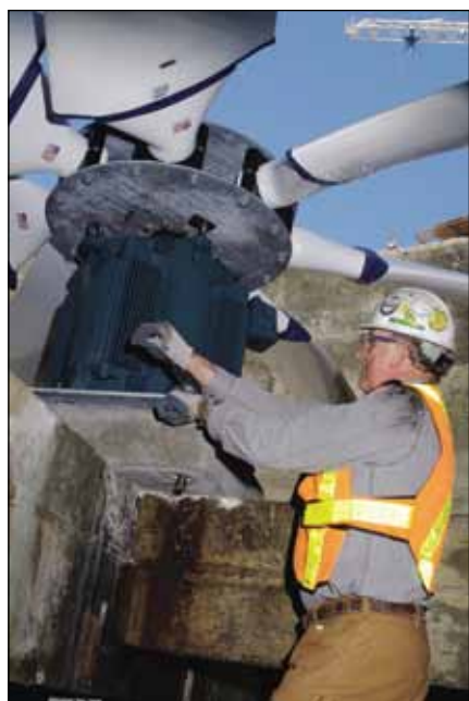
Eliminating many of the components of the right-angle geared system, the Baldor Reliance RPM AC Cooling Tower Direct Drive Motor is available in either flange mount or foot mount.