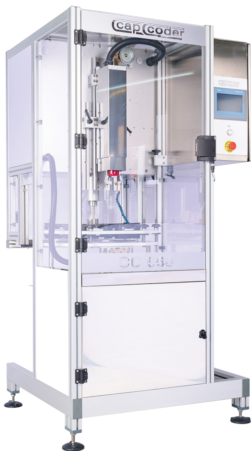
Capping and filling machine.

Huco can design and deliver custom Beam, Bellows and Oldham couplings to fit shafts from <1 up to 50 millimeters in diameter. Designed to provide couplings in low volumes to support prototyping, testing or small production runs, customers can expect the design process to be complete in a