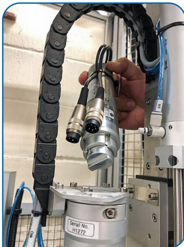
Since introduction of the Huco Oldham coupling, Cap Coder has not had a coupling failure on any of its machines.

powertransmission.com/articles/225-john-oldham-the-coupling-personified