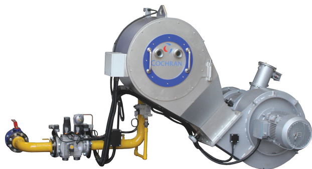
Couplings with zero-backlash were needed to support Cochran's burner models.

Different coupling designs accommodate misalignment in different ways. Huco's standard range of couplings offers design engineers a wide range of solutions to accommodate it, along with consistent zero-backlash capabilities, to safeguard the reliability of associated equipment.