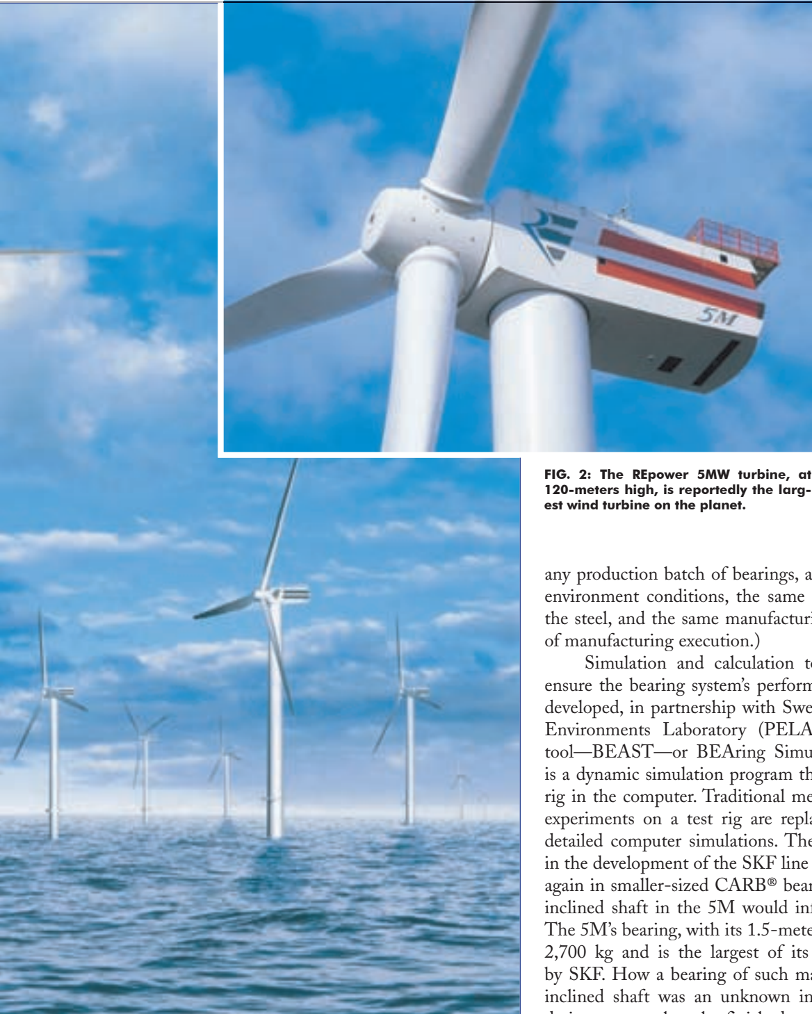
FIG. 2: The REpower 5MW turbine, at 120-meters high, is reportedly the largest wind turbine on the planet.

any production batch of bearings, assuming the loading and environment conditions, the same quality of ingredients of the steel, and the same manufacturing processes and quality of manufacturing execution.)