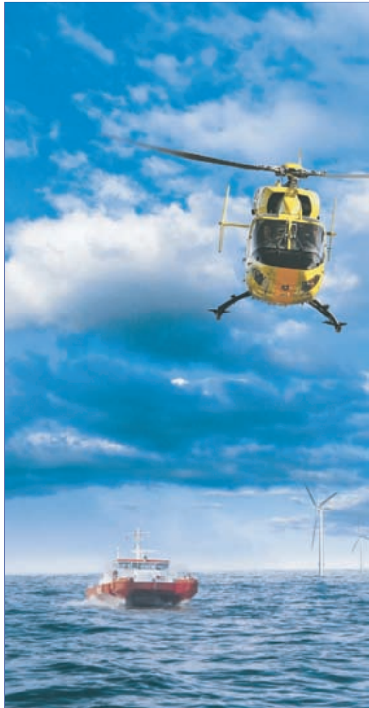
FIG. 1: Wind turbine designers believe that offshore installations are the most energy-productive, but they must be built to withstand the sea's harsh elements.

To eliminate the influence of positional- and deflection-related errors, the SKF specialists, in cooperation with