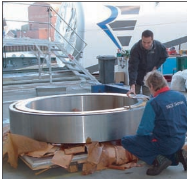
FIG. 5: The CARB® toroidal roller bearing being clamped prior to heating.