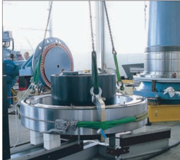
FIG. 4: Positioning the CARB® bearing system onto the custom-designed induction heater.