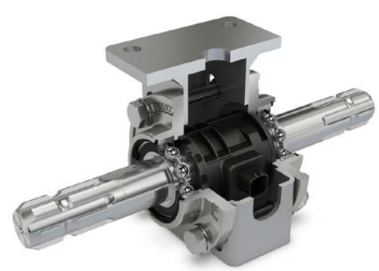
This FAG torque measurement module for agricultural applications transfers its data to the control system via the ISOBUS. All relevant parameters such as the speed and torque of the take-off shaft, the push-off speed, and the system's hydraulic pressure are recorded using sensors and then processed in the control unit.

In North America we started a center of excellence for mechatronics. located in Fort Mill. South Carolina. With this dedicated team we develop bearing based modules and systems for rotary and linear motion, as well as multi-axis systems and complete solutions. We started five years ago,