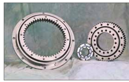
Kaydon offers a variety of bearings for heavy industrial applications including the geared, non-geared and catalog items pictured above.