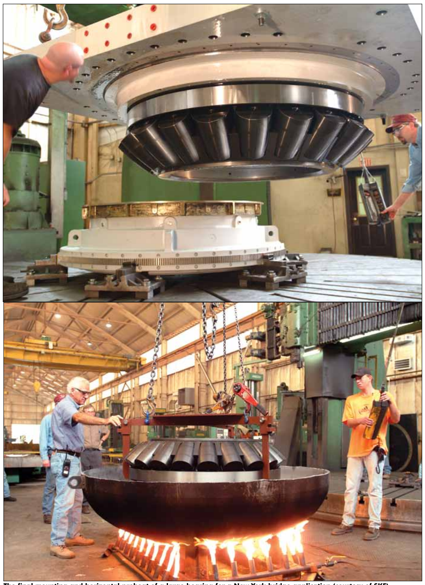
The final mounting and horizontal preheat of a large bearing for a New York bridge application.