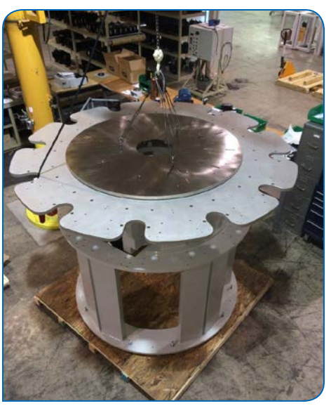
To accommodate the downward forces generated by the assembly machine's press stations, the Weiss design uses an intermediate riser weldment going through the indexer and bolting to the middle riser frame.

solution—delivering a 26 second cycle time with an indexing speed of 2.3 seconds.