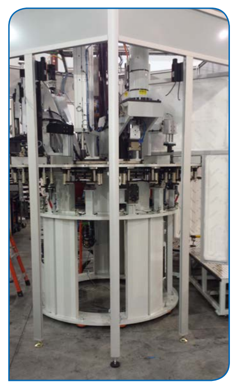
This automated assembly machine produced by Alpha Integration, required an innovative design and custom approach from supplier Weiss North America.

In the process of laying out the plan of the machine, Alpha's senior mechanical design engineer, Sam Westbrooks, knew he wanted an open-center indexer to mount the tooling towards the inside of the dial system on a stationary center plate. This design configuration would accommodate ease-of-loading for its 12 load stations, as well as pro-