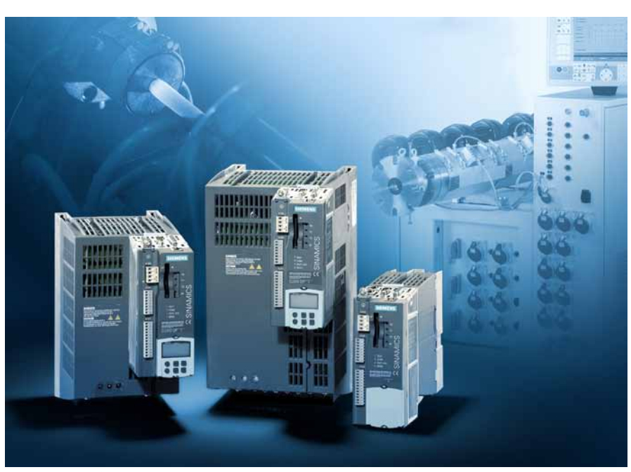
Siemens Automation & Drives Sinamics $120 system offers an integrated modular drives system for single-axis and multi-axis applications.

Siemens Industry, Inc. Drive Technologies-Motion Control 390 Kent Avenue Elk Grove Village, IL 60007 Phone: (847) 640-1595 www.siemens.com