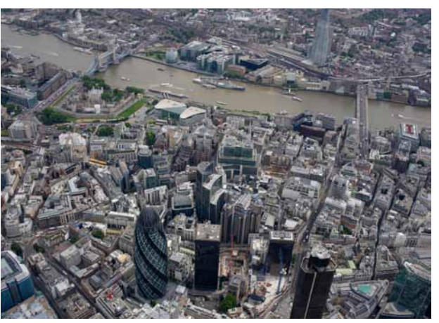
London is just one of several cities where Siemens is dedicated to improving energy efficiency and sustainability initiatives.

Adds Kerns at Siemens, "The mentality is there and the government is trying to offer more to the industrial market. The Consortium for Energy Ef-