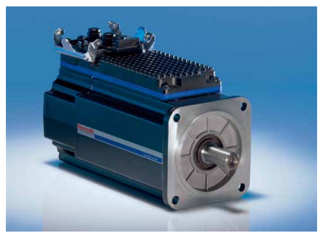
The IndraDrive Mi is an integrated drive/control system that dramatically reduces installation costs (courtesy of Bosch Rexroth).

"We have a green initiative at the corporate level to pull all of these different efficiency facets together under one umbrella. It's something that is integral to the success of our business