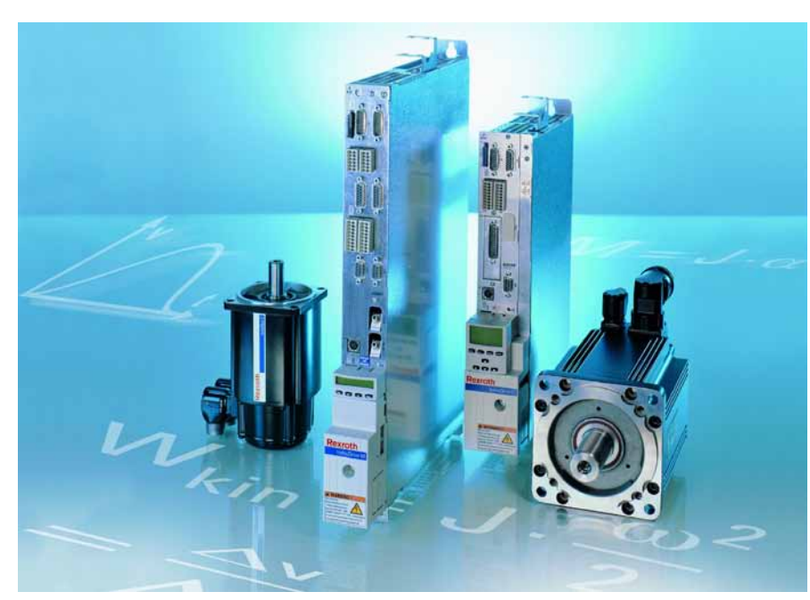
Bosch Rexroth offers a complete line of energy efficient products and services.