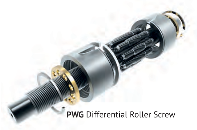
PWG Differential Roller Screw

So while innovative products make up the heart of Schaeffler's offerings to our customers, service represents the soul of what we do. Because when it comes to linear guidance systems, Schaeffler has all the pieces; you only have to supply the puzzle. Together, we'll create the perfect linear solution... yours.